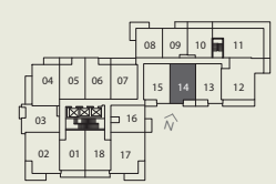
5TH FLOOR 9'-0" CEILINGS.