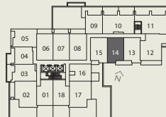
3RD FLOOR 9'-10" CEILINGS UNITS 1-3 & 6-18. 8'-10" CEILINGS UNITS 4 & 5.