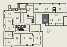
2ND FLOOR 9'-10" CEILINGS UNITS 1-15, 17 & 18. 8'-10" CEILINGS UNIT 16.