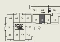
4TH, 6TH, 7TH FLOORS 9'-0" CEILINGS UNITS 1-17 ON 4TH & 6TH FLOORS. 9'-0" CEILINGS UNITS 8-14 ON 7TH FLOOR. 9'-10" CEILINGS UNITS 1-7 & 15-17 ON 7TH FLOOR.