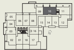
3RD FLOOR 9'-10" CEILINGS UNITS 1-3 & 6-18. 8'-10" CEILINGS UNITS 4 & 5.