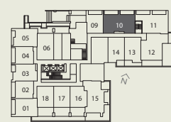
2ND FLOOR 9'-10" CEILINGS UNITS 1-15, 17 & 18. 8'-10" CEILINGS UNIT 16.