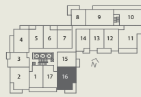
6TH & 8TH FLOOR